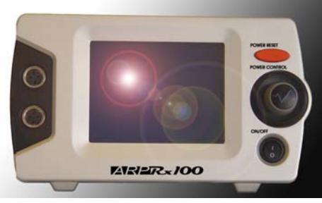
www ARPwaye com